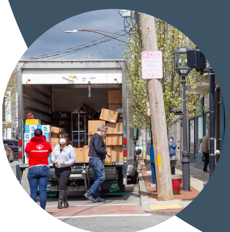
Food Distribution at Pan Y Café by La Colaborativa